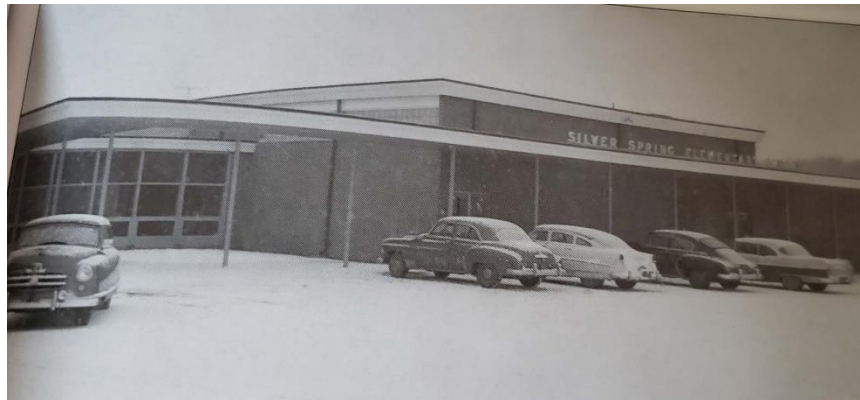
Silver Spring Elementary