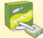
Tampons and pads

The label might say “Flushable,” but disposable wipes and other products clog septic and sewer lines and damage pumps and other equipment. Not only are these problems expensive to fix, they can also cause raw sewage overflows into homes, businesses and local waterways. So, think trash, not toilets!