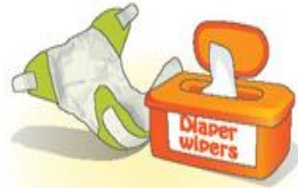
Disposable diapers, nursing pads & baby wipes